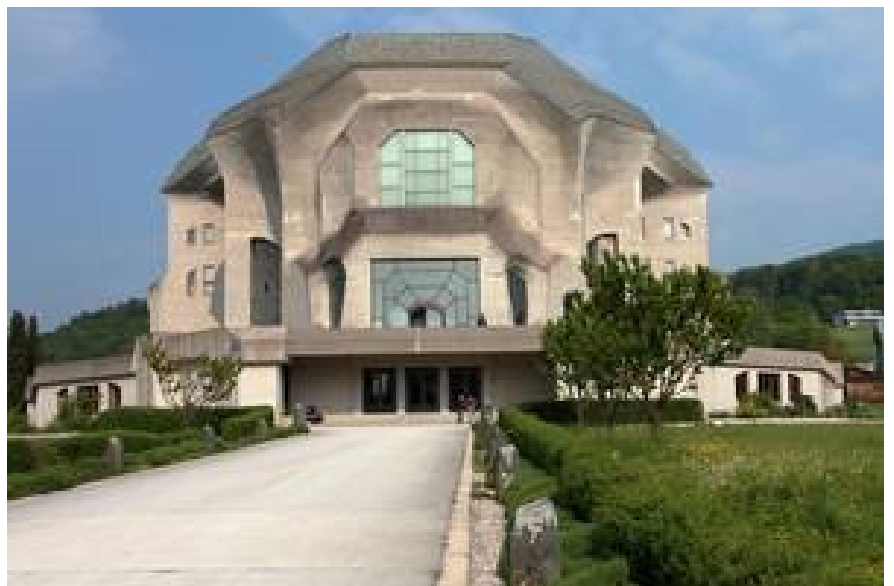
The Goetheanum in Dornach (Schwitzerland)

The new system had to handle various data types such as long text fields, selection lists or date fields. A full indexing of database content and documents with keyword search also had to be available.